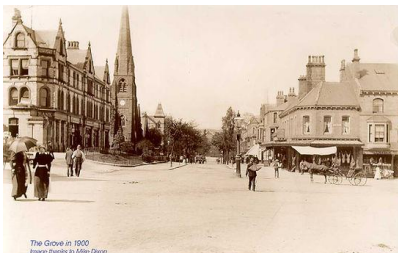
The Grove in Ilkley was built throughout the 19 th century.