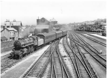
Ilkley train station opened in August 1865.